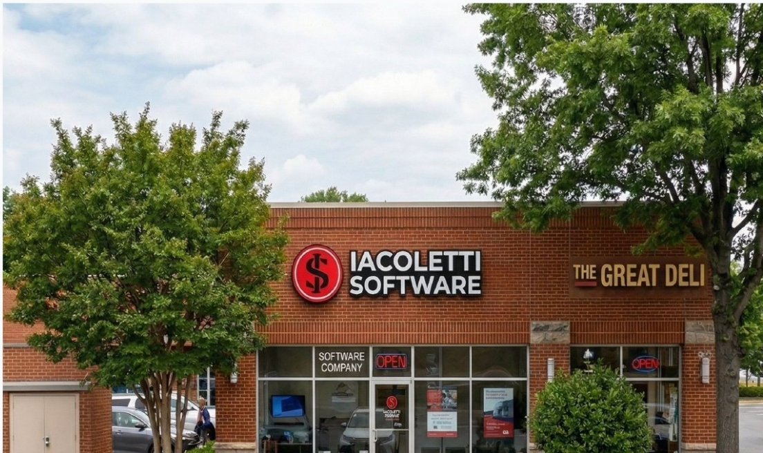
Figure 3 — AI-generated strip mall (fictional test image)

The test image is a photorealistic AI-generated photograph of a suburban commercial strip mall featuring an "Iacoletti Software" storefront alongside neighboring businesses. The image contains multiple vehicles, pedestrians, architectural elements, signage, and vegetation — providing a rich multi-element scene for DescribeThat to analyze. The image was generated using Google's Nano Banana image model in Gemini.